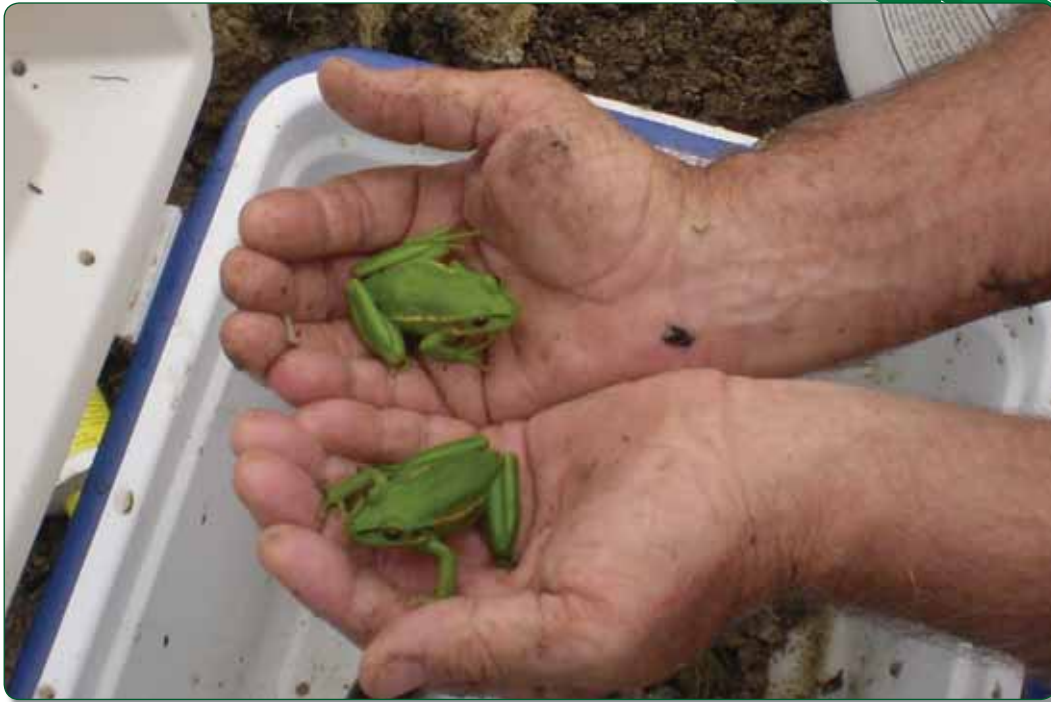
These Australian green frogs are very grateful for Kiwi hospitality