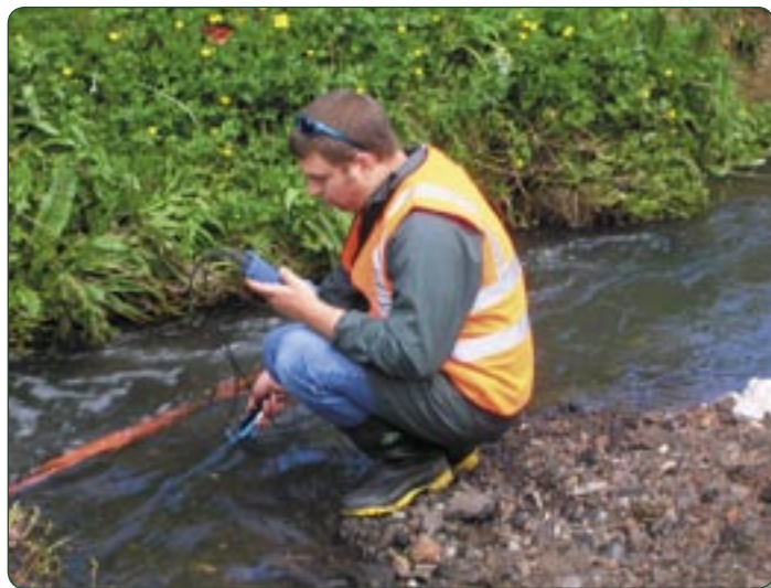
Water quality is measured at Puhinui Stream

Once work is underway new samples will show if the stream's oxygen and pH levels have changed.